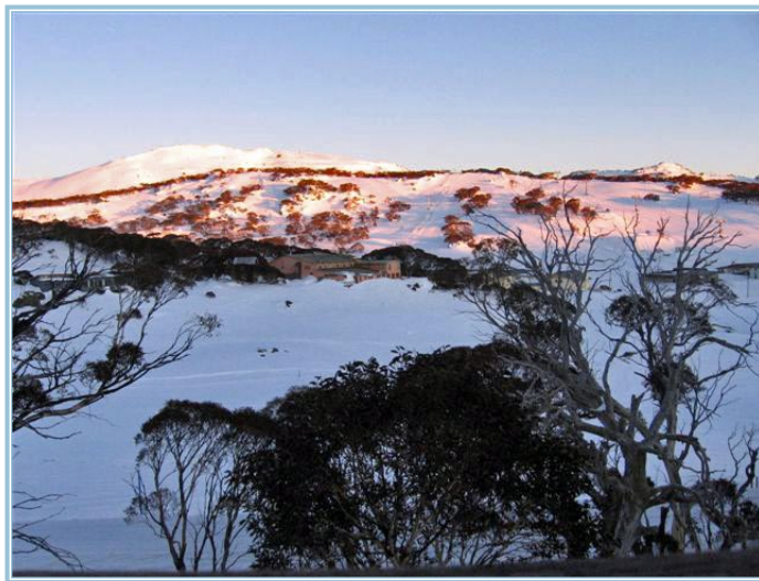
The start of another great day from “the best little ski lodge in Perisher Valley

Phone: +61 2 6457 5200 Fax: +61 2 6457 5600 Email: ullrlodge1@telstra.com Web: www.ullrlodge.com.au