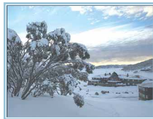
The Chalet Hotel

Whilst a number of key assets were already in place, there was no time wasted upgrading some of the infrastructure and services. During last summer, restoration of the historic and iconic Kosciuszko Chalet Hotel commenced including a new coat of paint and structural repairs. Additional work included an environmental audit across the Resort – confirming the commitment to ecological sustainability at Charlotte Pass.