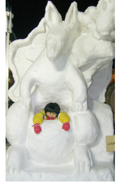
At Furano's Snow Festival, Hokkaido

From discussion around Ullr's dinner table it sounds as though there'll be quite a few other members and friends heading to Japan in 2007.