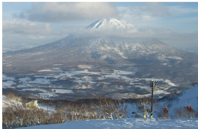
Mount Yotei, Niseko area, Hokkaido